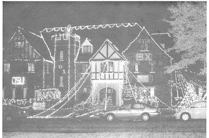
Theta Chi's entry in the annual IFC Holiday lighting contest took fourth place.