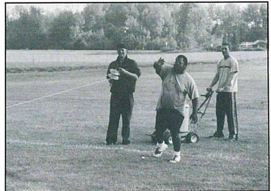
Sigma Chapter brothers paint the grid on the gridiron at Crescent Valley High School.