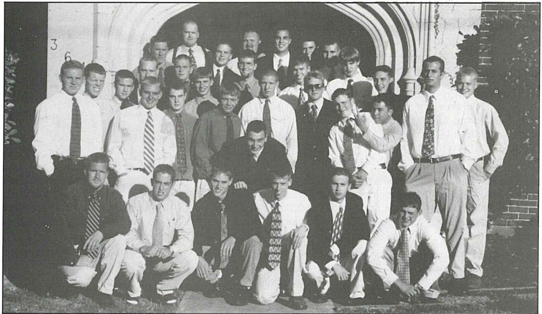
Sigma Chapter members pose outside the house on a rare sunny day.