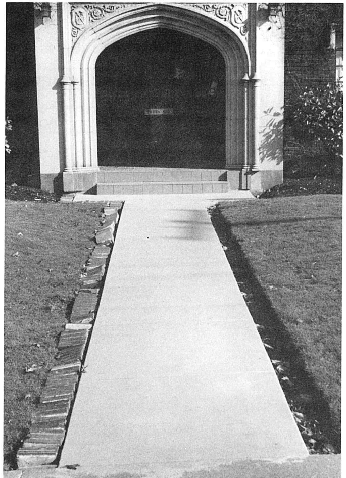
The Theta Chi Chapter is proud of its new walkway.