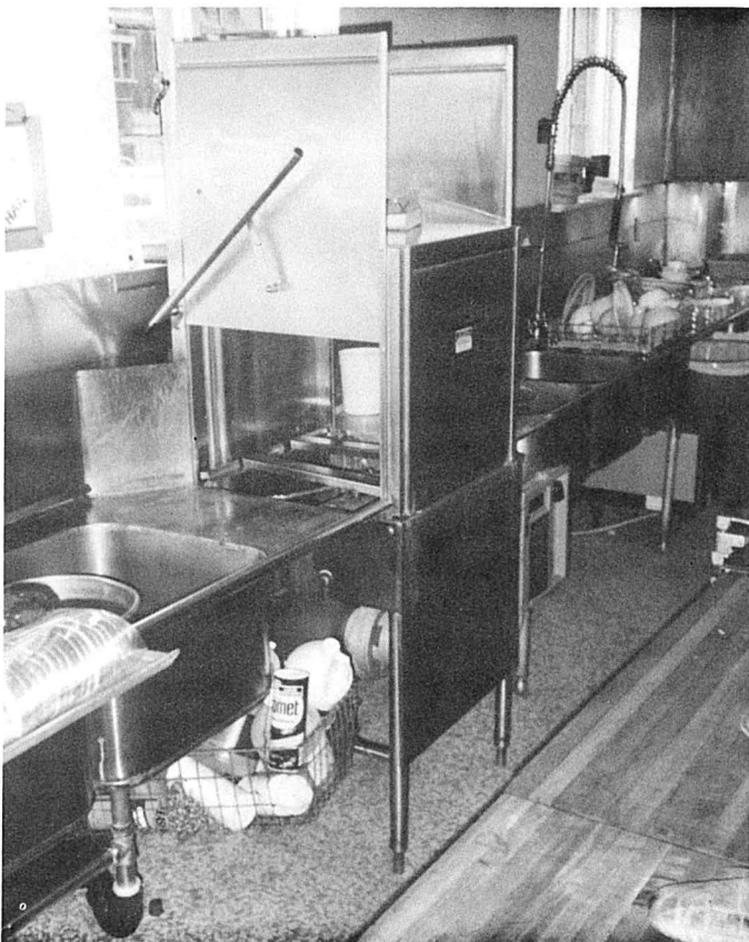
Alumni support helps purchase Hobart dishwasher.