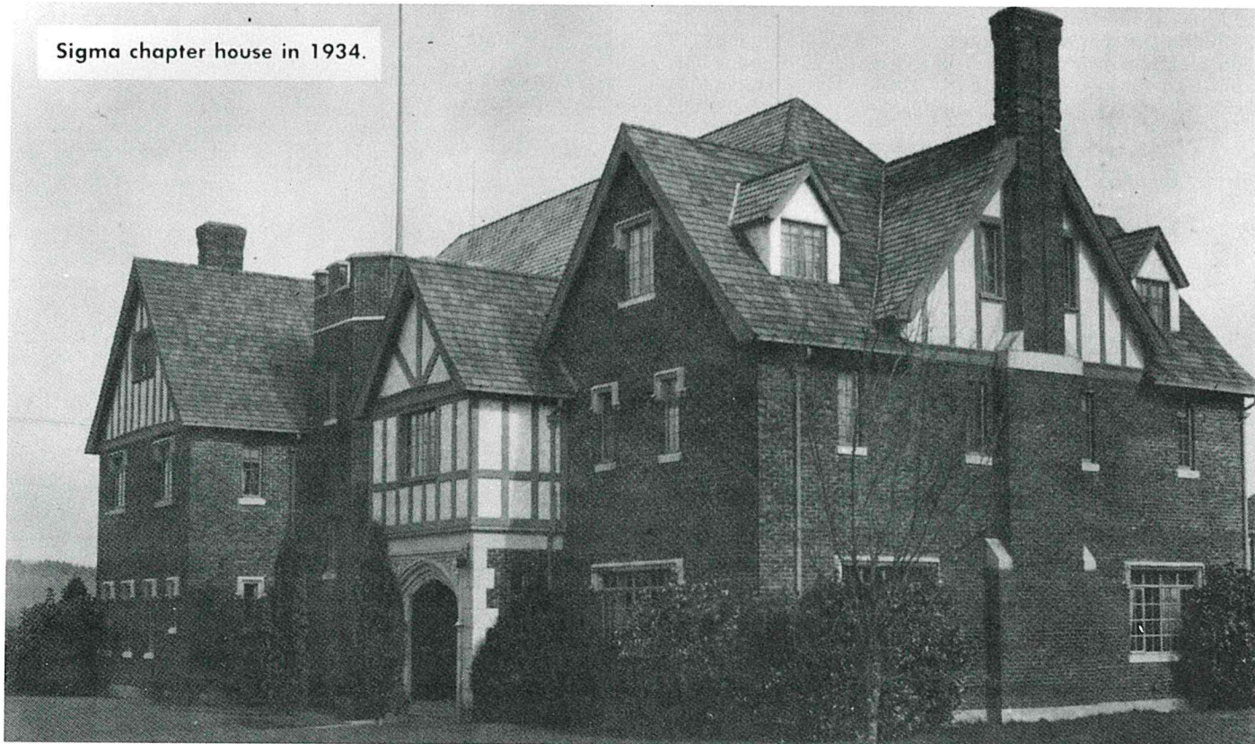
Sigma chapter house in 1934.