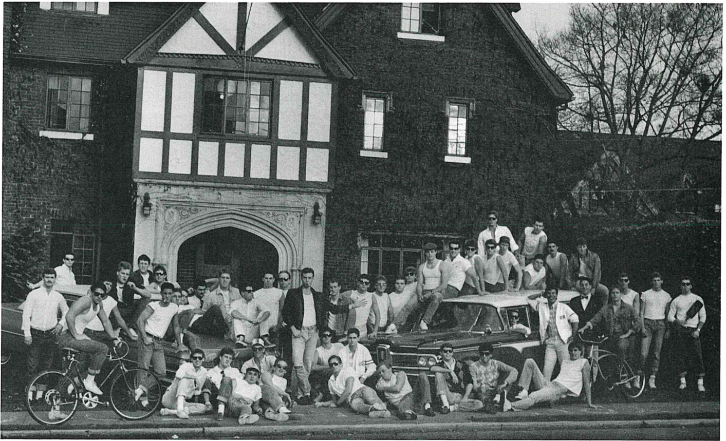
Our 1986 all-house photo with a '50s theme.