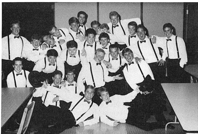
IFC singers relax before the show.