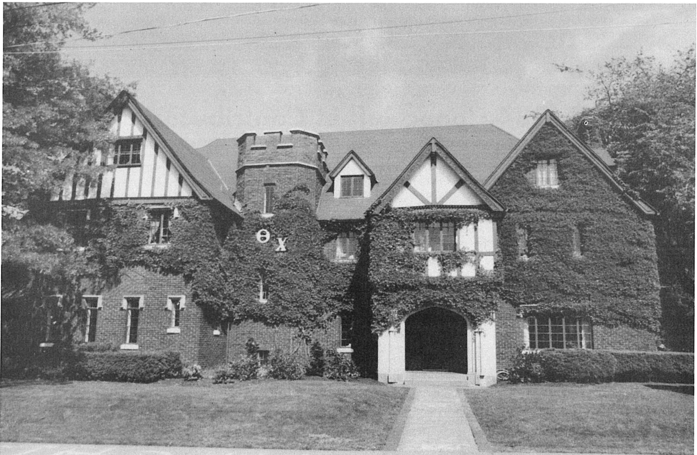
You can be sure a warm welcome always awaits you at Sigma Chapter of Theta Chi, 361 NW 26th St., Corvallis.