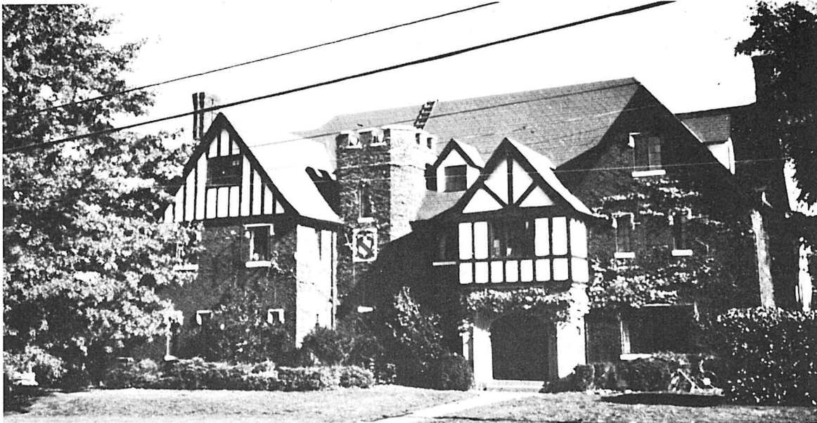
Our castle — our home!