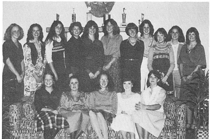
Members of the court, Daughters of the Crossed Swords.

The changes made in the Daughters of the Crossed Swords are all for the better, and the women on the court are proving that they are very important to the men of Sigma chapter.